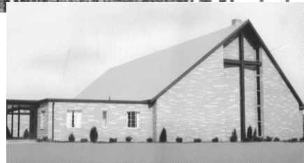
Davison Road 1963